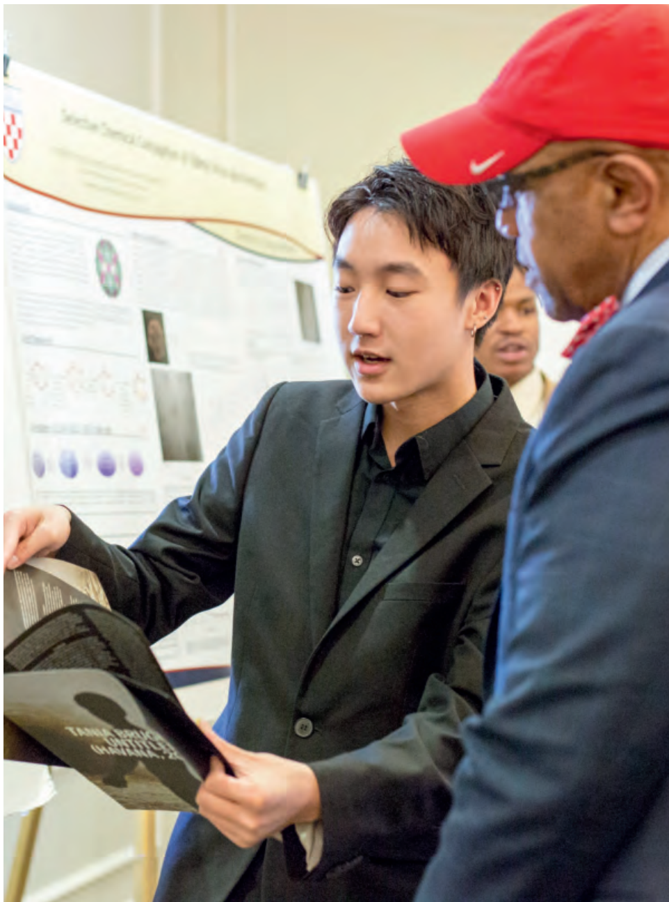
PHOTOGRAPHY FROM 2018 STUDENT SYMPOSIUM