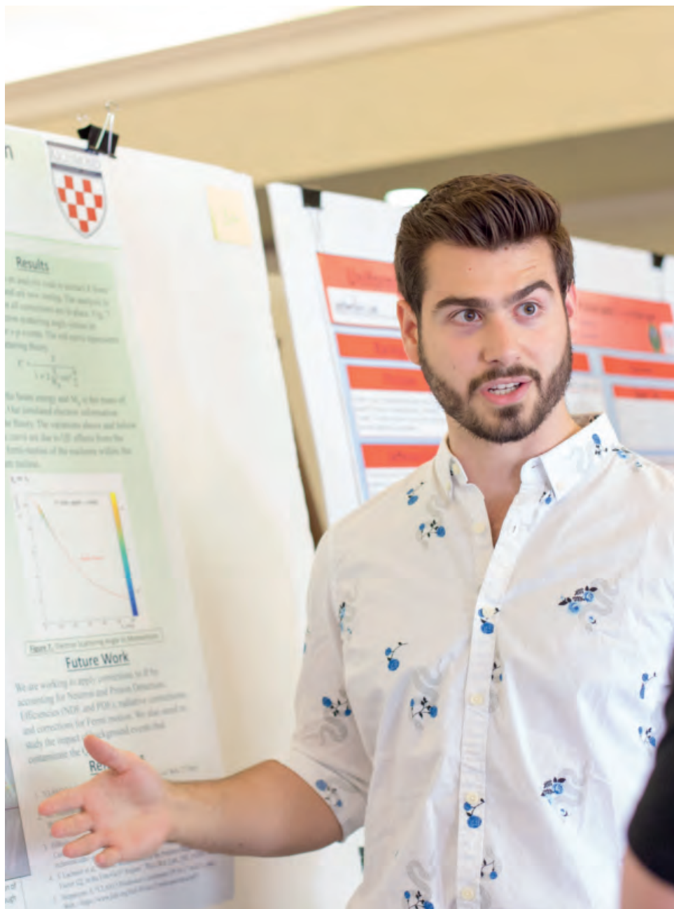
PHOTOGRAPHY FROM 2018 STUDENT SYMPOSIUM